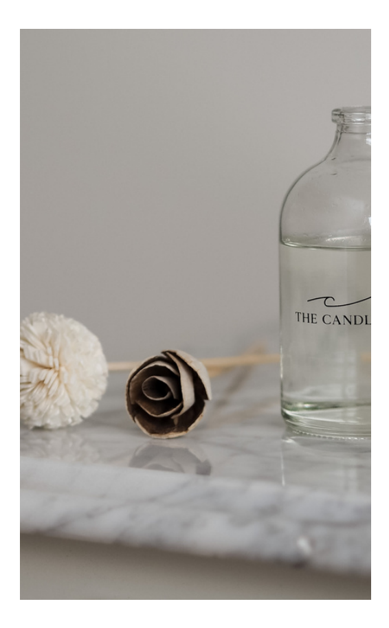
THE CANDLE BRAND