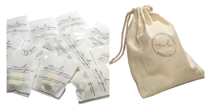
Pg. 9 Botanical wax melts